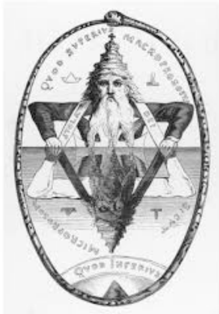
Illustration of Great Symbol, of Solomon.