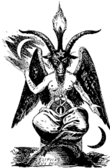
Illustration of Baphomet.(51)